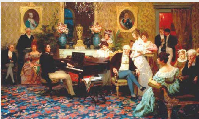
Chopin Playing the Piano in Prince Radziwill's Salon (painted by Henryk Siemiradzki in 1887)