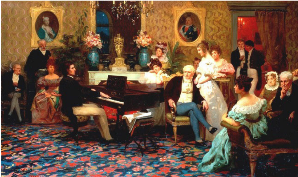
Chopin Playing the Piano in Prince Radziwill's Salon (painted by Henryk Siemiradzki in 1887).